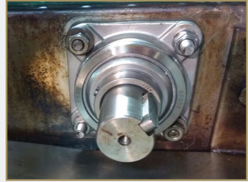
PEER Bearing after 1 year in use.