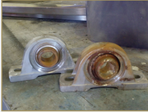
Competitor after 90 days in use.

On the left side, a competitor's bearing after 90 days vs. PEER Bearing after 1 year on the right side.