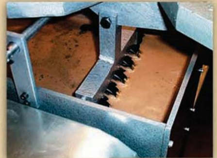
MUD SLURRY TEST FIXTURE

The test is performed to determine the effectiveness of the bearing sealing device to withstand contamination intrusion under aggressive environmental conditions. Seal designs are tested against competitive parts in side-by-side mud slurry testing. In this test, bearings are operated while submerged in a suspension containing Water, Arizona Coarse Test Dust (ISO 12103-1 A4 coarse test dust), Fertilizer, and Calcium Chloride.